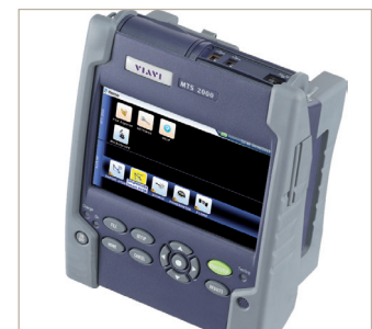
For more fiber testing and certification capabilities, combine the Certifier40G with one of the market-leading VIAVI fiber testers, such as the T-BERD/MTS-2000, OLTS-85P, and MPOLx.