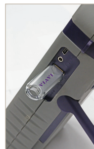
USB flash drive supports transferring test results