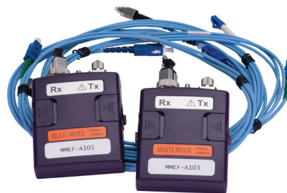
Multimode (encircled flux) modules