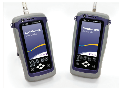
Two complete units minimize time initiating, naming, and saving results